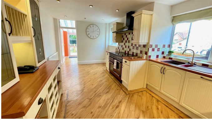
KITCHEN/BREAKFAST ROOM 18'7" x 9'6" (5.68m x 2.91m)

Fitted range of Cream Shaker style base, wall, drawer, glass fronted and corner display shelving with display lighting, under unit lighting, inset 1½ bowl sink unit and mixer top, integrated 'Ariston' dishwasher, fridge, 'Rangemaster 110' cooking range with twin ovens, grill and 5 ring gas hob with hotplate and cooker canopy over, round edge worktops, decorative tiling, 'Karndean' flooring, recessed spotlights, upvc double glazed windows, radiator, access through to:-