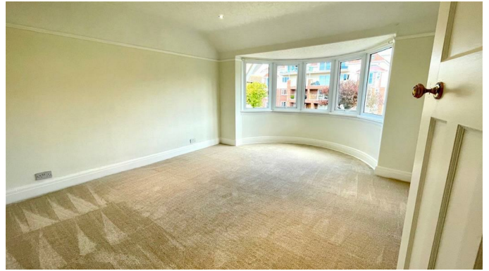
PRINCIPAL BEDROOM 17'0" x 12'11" (5.19m x 3.94m)

Picture rails, recessed down lighters to ceiling, upvc double glazed bow window, double radiator.